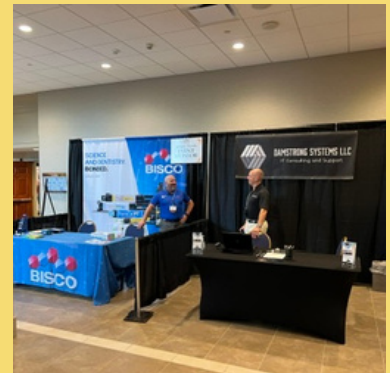
Exhibit space will be assigned by VSIDS at its discretion, on a first-come, first-served basis and may be subject to change. Sponsor status and years of participation will also be considered.